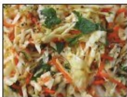
Coleslaw $15.00 Serves 10