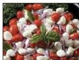
Fresh Mozzarella & Tomato $39.00 Serves 10