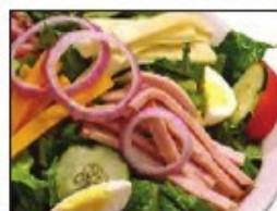
Tossed Salad $32.00 Serves 10