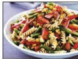
Pasta Salad with Vegetable $30.00 Serves 10