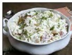
Redskin Potato Salad $20.00 Serves 10