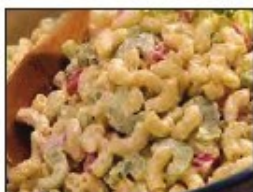
Macaroni Salad $20.00 Serves 10