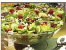
Greek Salad $39.00 Serves 10