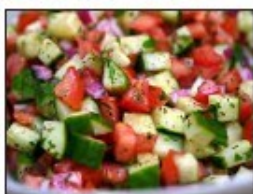
Israel Salad $20.00 Serves 10