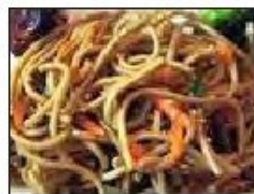
Oriental Noodle $20.00 Serves 10