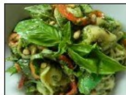
Cheese Tortellini Salad $30.00 Serves 10